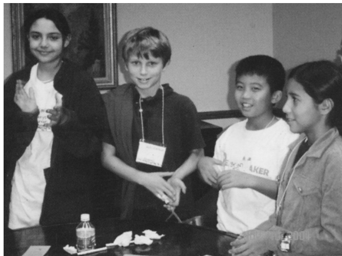
Children in structured workshops can learn the principles of peace and reconciliation at the elementary level.

In 2006 Leigh was part of a program that taught "knowing the consequences of my actions" to more than 9,000 children and parents. Such small steps sow the seeds of true reconciliation.