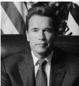
California Governor Arnold Schwarzenegger

Pasadena, CA: Speaking recently at the prestigious Ambassador Auditorium, Governor Arnold Schwarzenegger paid tribute to the efforts of the Western Justice Center Foundation in reducing inner-city conflict. The Center was celebrating its move into the fourth and final building of its Pasadena campus.