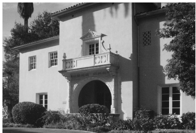
Elegant 4th building of Western Justice Center

Mr. Schwarzenegger reminded the audience that no matter how entrenched certain problems seem, caring people can make a difference. He praised the efforts of his wife's mother, Eunice Kennedy Shriver, in starting the Special Olympics. "The nation of China used to screen out its specially challenged citizens," the Governor stated. "Now they are hosting the Special Olympics." Yes, change is possible! Let's go out and do likewise.